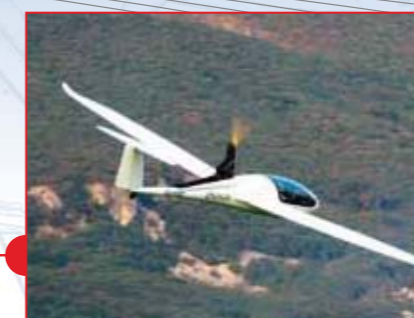
Lightweight eco-friendly aircraft flying