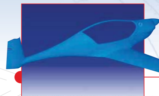
Pipistrel's aircraft designed with CATIA PLM Express